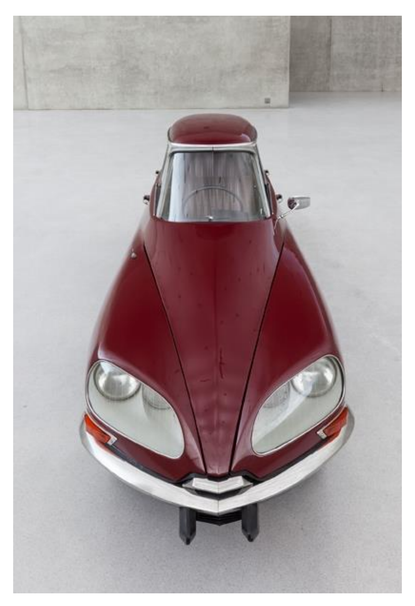
La DS (Cornaline), 2013. Courtesy the artist; Marian Goodman Gallery, New York, Paris & London; Galerie Chantal Crousel, Paris; and Kurimanzutto, Mexico City