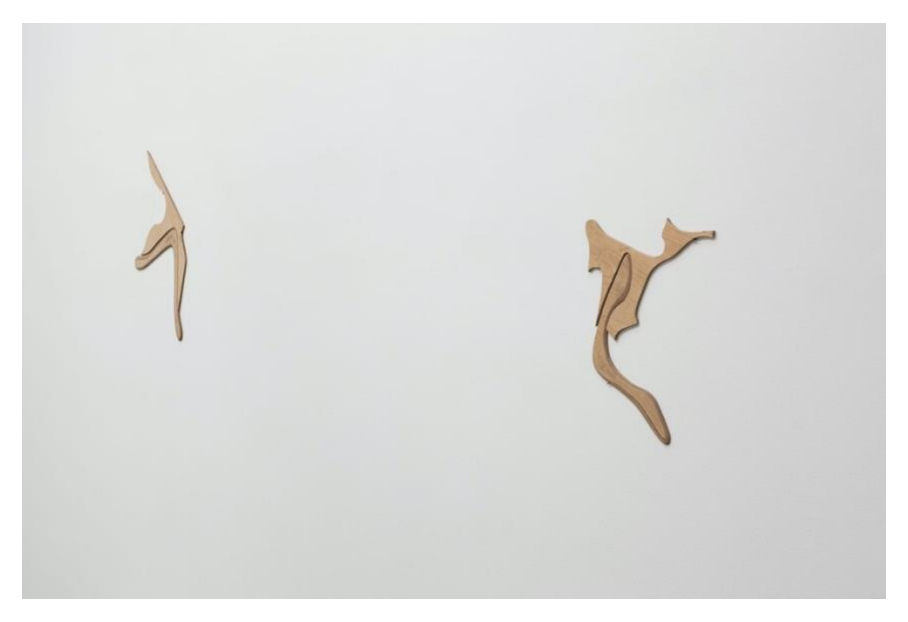
Inner Cut, 2014, wood and graphite, dimensions variable (installation view, Marian Goodman Gallery, New York, 2014)

by Christian Viveros-Fauné (March 27, 2015)