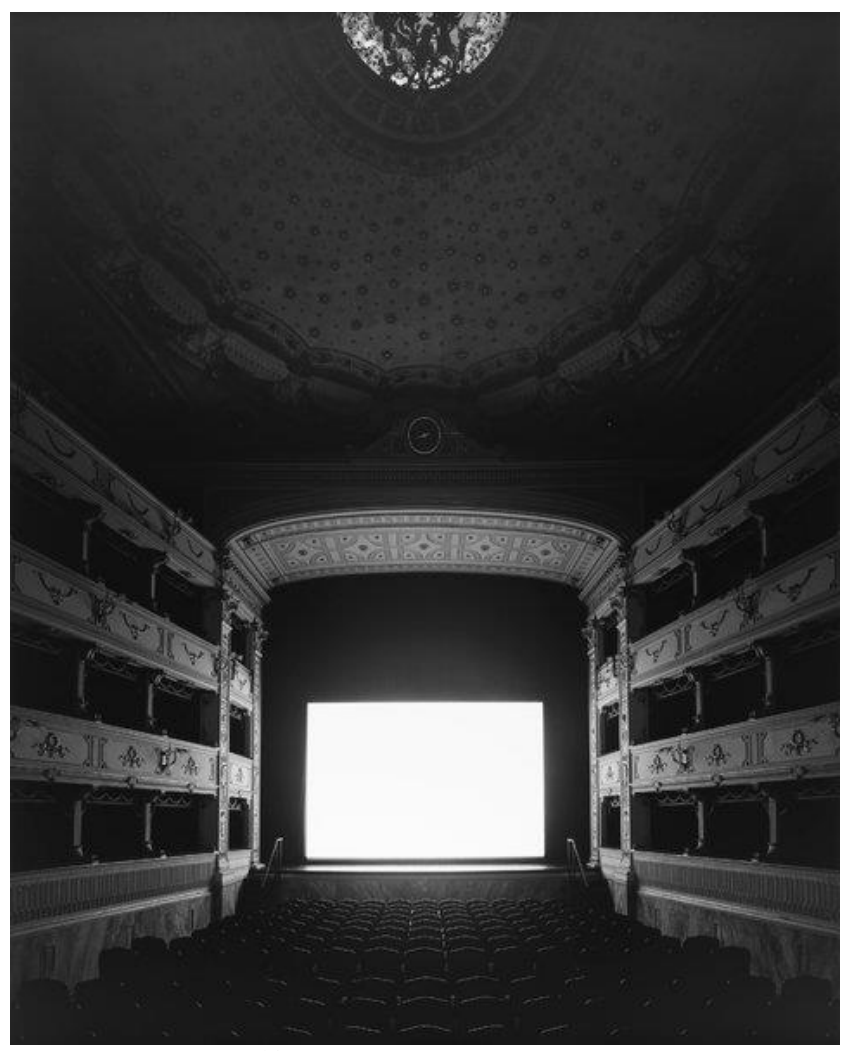
"Summertime" (1955) at Teatro dei Rozzi. Siena, Italy. 2014.

"Usually a photographer hangs around and captures the moment, but I created my own illusion that doesn't exist in reality," he said. "It's just my own imagination — but I get to make my imagination visible."